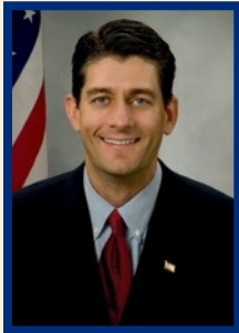
Rep. Paul Ryan